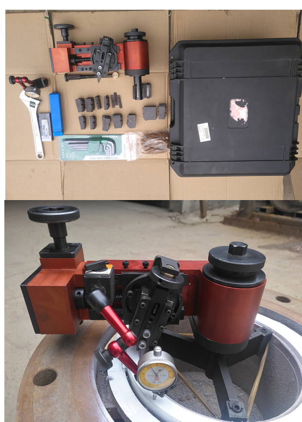
Page 2 of 2

Xinxiang Jierui Machine Tool Co., Ltd • Total support • Complete solutions • Provide portable machines and services worldwide We are dedicated to providing equipments and technical services for you. If you have any questions, please feel free to contact us.